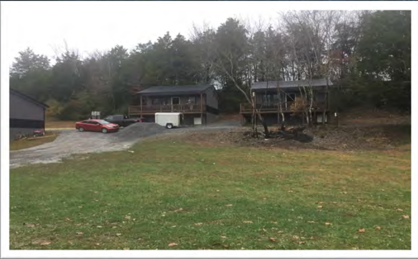
These cabins are existing rental units currently operated by Riverside Resorts, LLC

This resort consists of 3 acres, adjacent to the Green River, in Green County, Kentucky. It has five (5) two-bedroom, one bath cabins on the property with a section left to build out a mini-golf course. This is scheduled for early spring (April-May). Guests of Riverside Resorts are able to utilize all services of the Paddle Trail Campground Resort at NO additional charge. All the land and improvements, buildings are fully paid for, there is NO debt, liens, or encumbrances on the property. Estimated value: $1.9 million dollars.