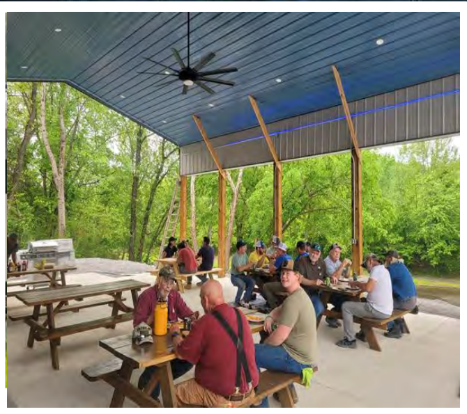
Picnic at Pavilion

Sitting on 17 acres right along the Green River in Green County, Kentucky this project consists of 60 concrete pad RV spots, (all have water, electricity & sewage) 9 pull camping trailers, 11 two bedroom, one bath rental cabins, 8 of which are “full timers”, convenience store, registration office, riverside pavilion with tables and fireplace, pet park, kiddie park, canoe and paddle boat rentals , boat ramp, showers and laundry facilities. Current estimated value is $3.5 million dollars all property and improvements are fully paid, there are NO liens or encumbrances. Members have received distribution of proceeds from operational profits, rental proceeds, and land sales.