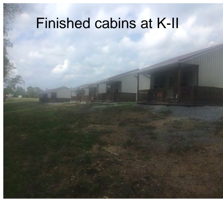
Finished cabins at K-II