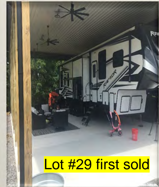
Lot #29 first sold

Located adjacent to KCR, K-II, also in Russell county, consists of 47 total acres and also within one (1) mile of Lake Cumberland, this property consists of 30 concrete 75' pads for RV's and nine (9) two-bedroom, one bath cabins. Of these 5 have current "full timers". There are 65 surveyed 1/5 th acre lots being prepared for second/vacation home build outs. Lot price for these homes is currently $65,000. Per lot. One additional item is the 1 acre, fenced, gate secured boat, vehicle, rental storage enclosure. Current estimated value: $3.5 million dollars. The property and all improvements are fully paid and there are NO liens or encumbrances.