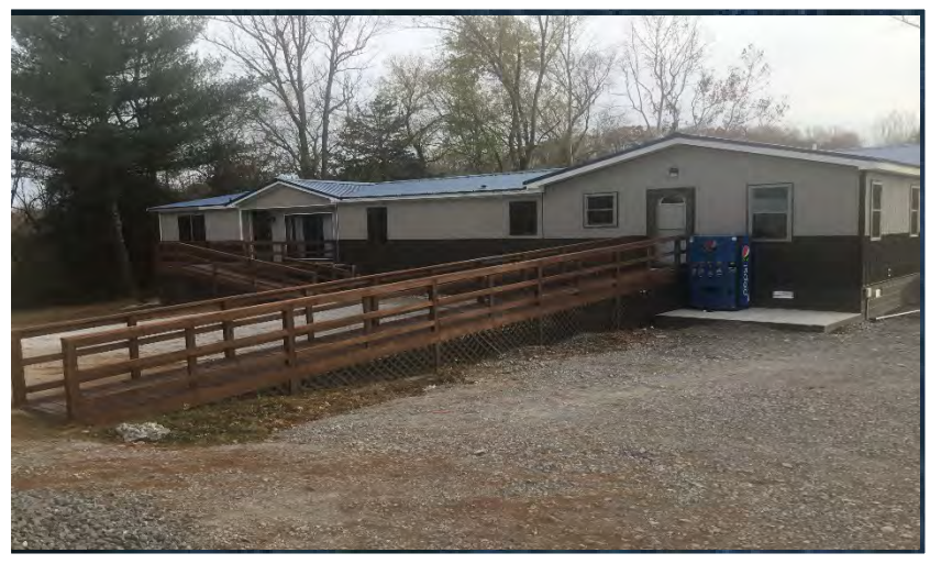
Registration office, lodge & Convenience Store