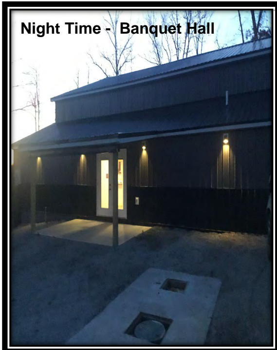
Night Time - Banquet Hall

This project sits on 10 acres, adjacent to the KCR property and Lake Cumberland. Reached by a county road and the only one of its kind currently in the market is an exceptional 3800' Banquet Hall. High ceilings, polished concrete floors and large windows make this excellent open facility with views of Lake Cumberland ideal for weddings, receptions, corporate retreats, or family reunions. The additional five cabins make family or corporate events easy to manage in an off-the-beaten path setting. Just recently completed, management has just begun to field inquiries as to dates and fee's. The property, buildings and all improvements are fully paid and complete. There are NO liens or encumbrances on the property. Current value: $2.5 million dollars.